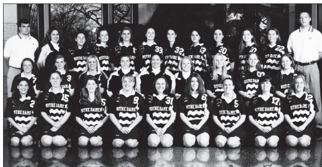
1997 Notre Dame Women's Lacrosse Team