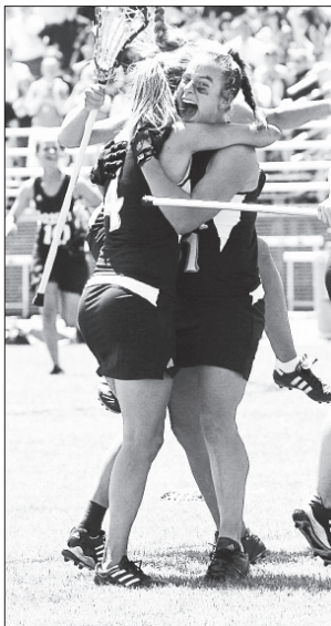
Notre Dame's first-ever win against Georgetown on May 20, 2006 sent the Irish to the 2006 NCAA Finals in Boston, Mass.

The Notre Dame women's lacrosse team ran into