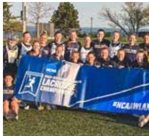
W. LACROSSE NCAA Tournament