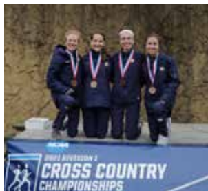
CROSS COUNTRY Women's: 5th Men's: 9th