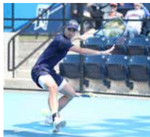
M. TENNIS NCAA Tournament