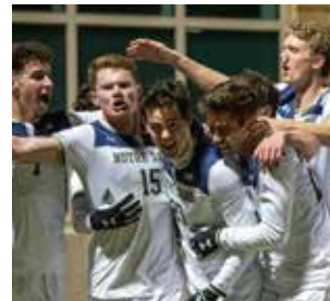
M. SOCCER NCAA College Cup