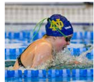
SWIMMING & DIVING Men's: 33rd Women's: 33rd