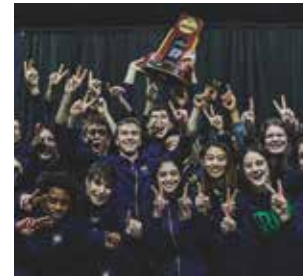
FENCING National Champions