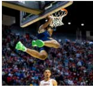
M. BASKETBALL NCAA Tournament Round of 32