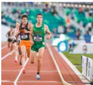
TRACK & FIELD Women's Indoor: 17th Men's Indoor: 28th (t) Men's Outdoor: 30th