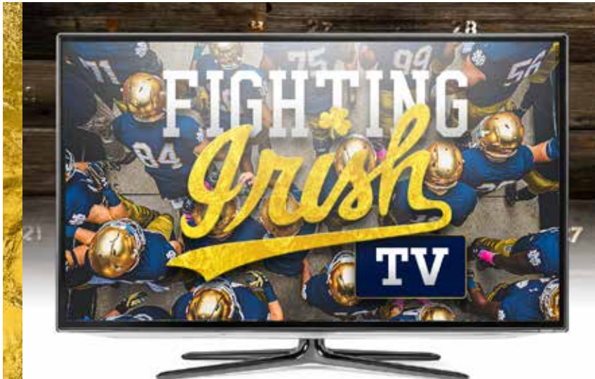
Our Fighting Irish TV platform makes Notre Dame Athletics content available on living room streaming platforms such as Apple TV.

Notre Dame has always been thought of as a Worldwide University, and in partnership with NBC began providing the opportunity to view Fighting Irish home games in football and hockey to subscribers around the globe. This undertaking will continue into the future under the Fighting Irish digital ecosystem.