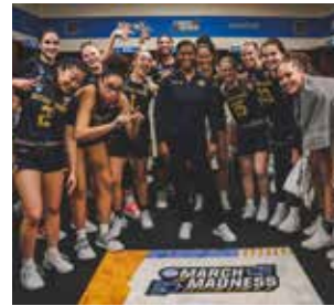
W. BASKETBALL NCAA Tournament Sweet Sixteen