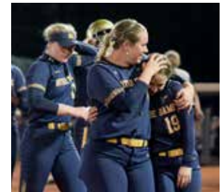
SOFTBALL NCAA Regional