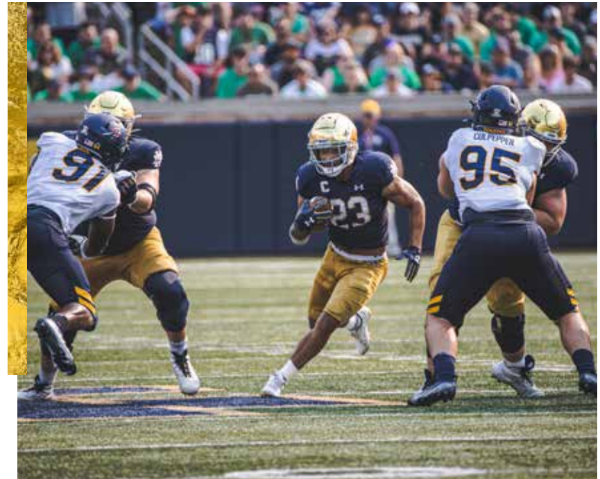
In the first college football game exclusively broadcast on Peacock, Notre Dame defeated Toledo at Notre Dame Stadium.