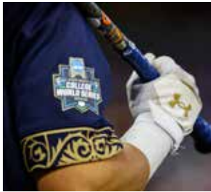
BASEBALL Men's College World Series