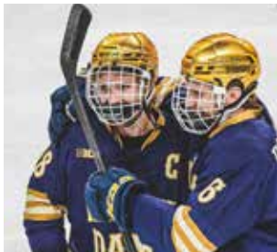
HOCKEY NCAA Regional Finalist