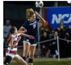
W. SOCCER NCAA Tournament Round of 16