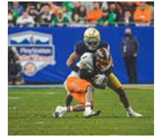
FOOTBALL New Year's Six PlayStation Fiesta Bowl